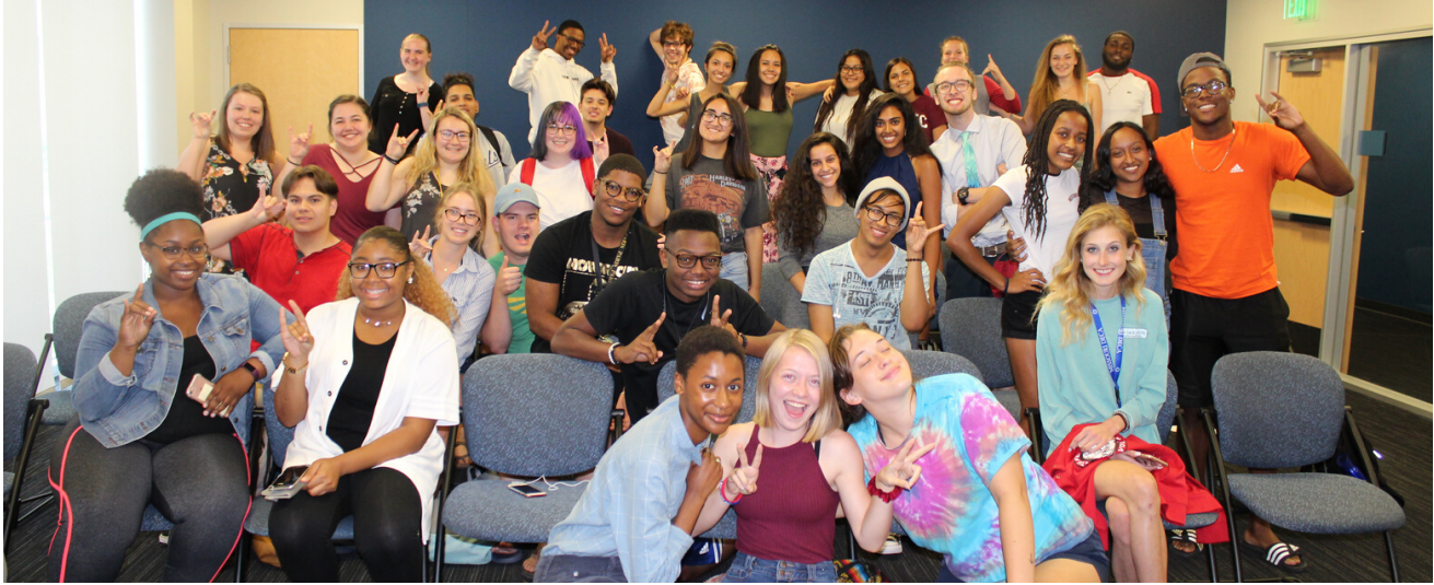
The Summer Bridge Scholars 2018 cohort