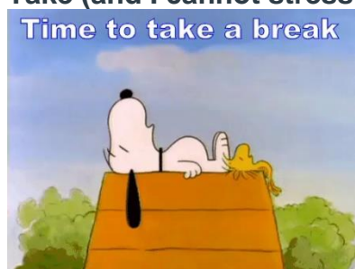
Take (and I cannot stress this enough) breaks

Limit those distractions! Don't get caught up scrolling through social media. It can become a hard habit to break through if you don't stop now!