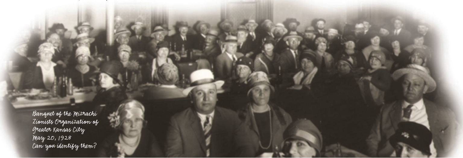
Banquet of the Mizrahi Zionists Organization of Greater Kansas City May 20, 1928 Can you identify them?