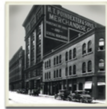
Poindexter's, 8th & Central. Circa 1930. Later became KC Boy's Wear. Its lobby now houses the Museum of The Kansas City Historic Garment Center.

Everyone. Families, businesses, organizations, institutions and individuals. Don't throw away your history. The Jewish community and persons of the Jewish faith have played a significant role in the Kansas City community for many generations. The Jewish community has been innovative and inspiring, making individual contributions to business and culture and collective contributions to welfare, education and social concerns. It is impossible to understand the history of this region without the knowledge of its Jewish history. Our story is incomplete without your story.