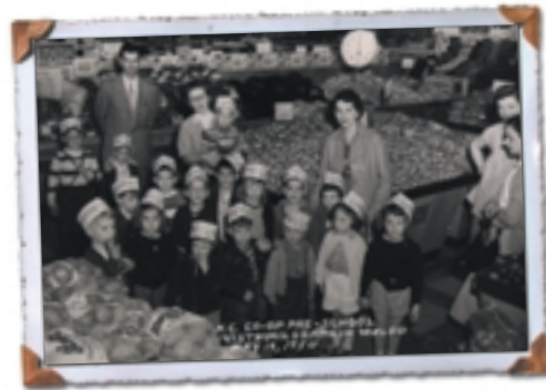
Kansas City Co-op Pre-School visits Milgrims in Waldo. May 19, 1954.

The Purim Ball was once an important tradition for a community celebration. In recent years, it has been revived in many communities to bring special honor to present-day Esthers and Mordecais.