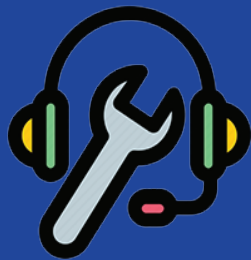
Technology Help & Support