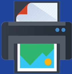
Computer Labs & Printing