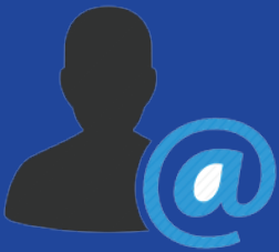
Accounts & Email